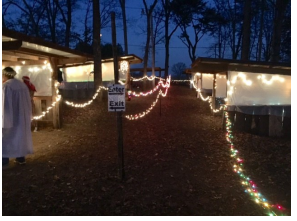
OHANA LIVING NATIVITY 2017